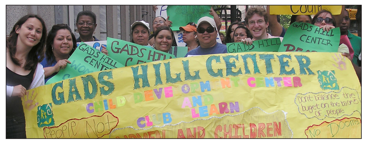
Gads Hill's employees protesting state budget cuts